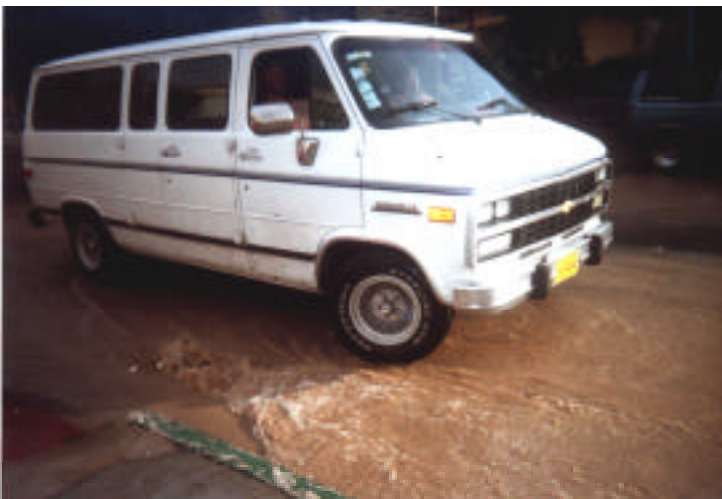
This is the van we were in, and the flood.

When we got back to town the roads were covered with water. Since it rarely ever rains they don't have much drainage for the water to run out.